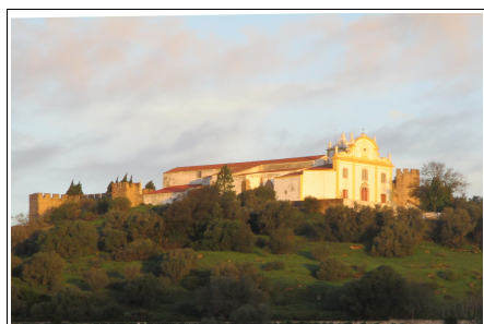
Fortified castle at Santiago do Cacem

Evening meal at nearby restaurant (not included in holiday price)